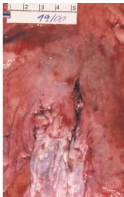
Figure 2 Giant laceration, measuring 55 \times 5 mm, with a vessel stump, probably the left gastric artery, observed at autopsy.

Mallory–Weiss tear is a mucosal laceration of the gastric cardia or gastroesophageal junction induced by retching or vomiting, which was first described by Kenneth Mallory and Soma Weiss in 1929 [5]. The lesion is generally believed to result from transient large gradients between intragastric and intrathoracic pressures at the gastroesophageal junction. When the gastroesophageal junction is elevated above the diaphragm, this gradient results in dilatation of the junction