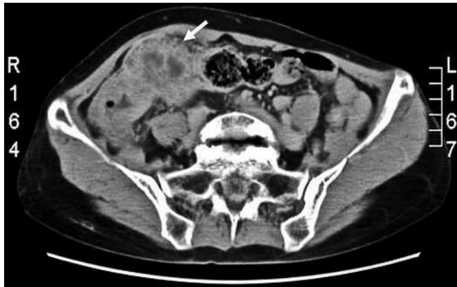
Figure 1 Contrast-enhanced abdominal computed tomography, showing cecal wall thickening and an ill-defined pericecal mass lesion with marginal enhancement (arrow).