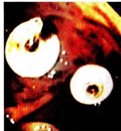
Figure 3: Endoscopic view of the silicon disks fixing the internal position of the PEG and PEGJ.

tive complications, since continuous gastric decompression and adequate long-term enteral nutrition were possible. We would recommend the method for the treatment of such cases.