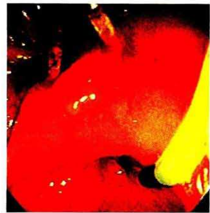
Figure 2: Cannulation was easily performed after the duodenal papilla had been exposed by anchoring the redundant Kerckring's fold to the duodenal mucosa cephalad with two clips.