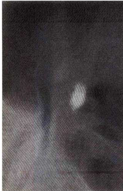
Figure 1: A smoothly contoured drop-like barium deposit shows the intact diverticulum prior to preparation for colonoscopy.