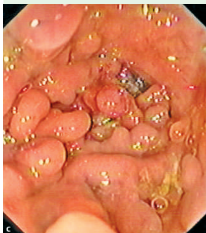
Fig. 1 Colonoscopy showed severe bridging fibrosis in the left colon and the sigmoid colon (a,b). There were also areas with pseudopolyps and a moderately severe stricture that was difficult to pass with the colonoscope (c).