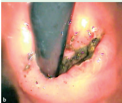
Fig. 1 Endoscopic views of the tissue necrosis in the esophagus (a), reaching down into the cardia (b), 6 hours after pacing.