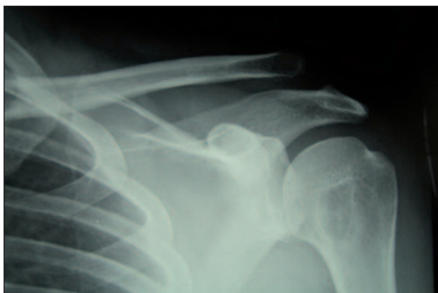
Fig. 3. Zanca view showing a type III AC joint injury.

The configuration of the AC joint on anteroposterior radiographs varies significantly. Zanca (36) reported that the AC joint width is normally between 1 and 3 mm. Petersson (37) reported that the AC joint space diminishes with increasing age, thus a joint space of 0.5 mm is normal in 60-year-old patients. The CC interspace can also exhibit variability. Bosworth (11) stated that the average distance between the clavicle and coracoid process is usually between 1.1 and 1.3 cm.