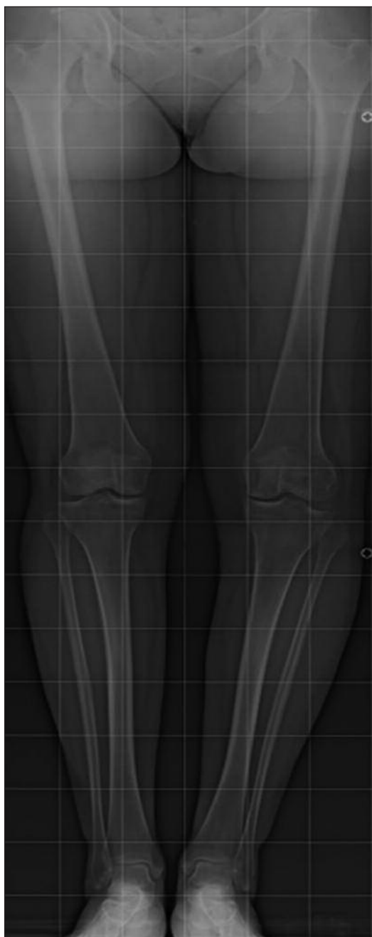
Fig. 1. Weight-bearing long-standing AP radiograph: varus malalignment of the limb due to the insufficiency of the lateral capsuloligamentous structures (arrow).

The patient agreed to undergo a complex two-stage sur-