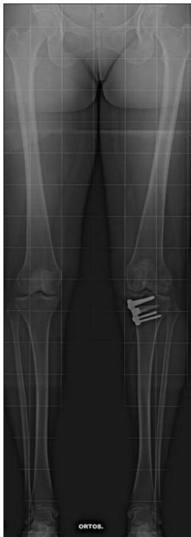
Fig. 4. Weight-bearing long-standing AP radiograph at the two year follow-up: the correction is maintained, the osteotomy is consolidated and the articular surfaces are intact.

Direct visual assessment during open surgery showed integrity of the popliteus tendon and the lateral collateral ligament, although the latter was loose; the other posterolateral capsular ligamentous structures were not clearly identifiable because of the presence of fibrotic