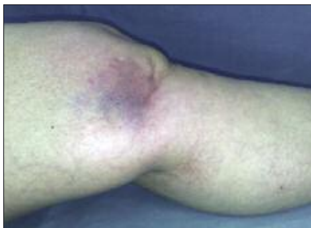
Fig. 1. Clinical appearance of the left knee in slight flexion and valgus, with invagination and severe ecchymosis of the skin and soft tissue on the medial side (“dimple sign”).

The reduction maneuver, performed by pushing the