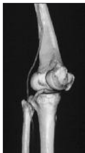
Fig. 3. The digital femoral arteriography excluded any damage of the popliteal artery.

tibia backward in internal rotation, was ineffective and thereafter it became necessary to proceed with open surgical reduction.