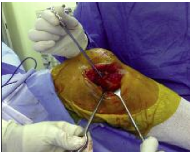
Fig. 6. Complete rupture of the MCL. The proximal end of the ligament is held by the scissors.

posterior cruciate ligament (PCL) were torn. Medial meniscus was intact.