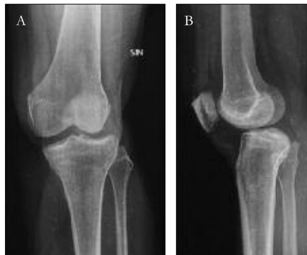
Fig. 2. Anteroposterior (A) and lateral (B) X-rays of the left knee after the trauma show a posterolateral subluxation of the tibia and enlargement of the medial joint space.