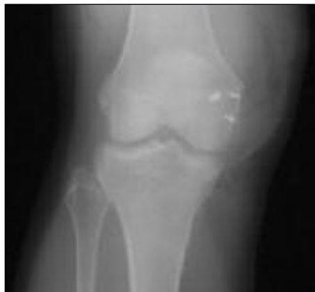
Fig. 7. Postoperative radiograph showing the three suture anchors used to fix the medial gastrocnemius muscle and the MCL proximally.