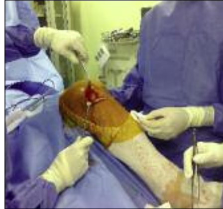
Fig. 5. The medial femoral condyle was evident through an ample breach of the extensor retinaculum, the deep fascia and the capsule.