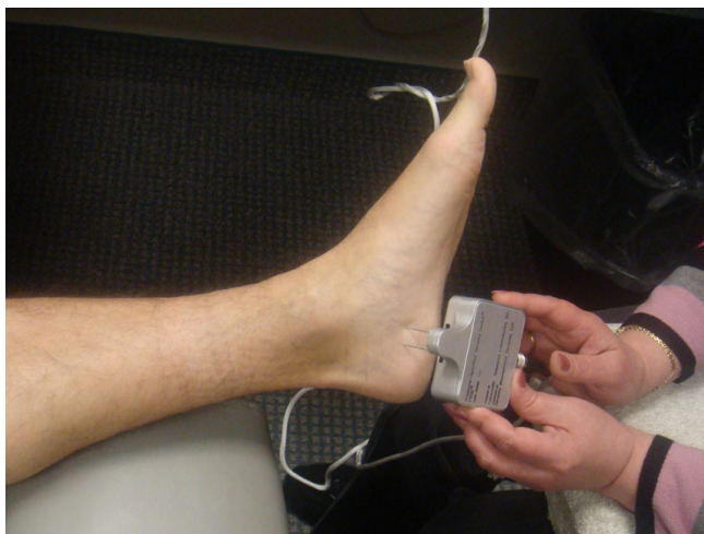
Figure 2 Measurement of 2 point discrimination in the medial heel which is in the distribution of the medial calcaneal nerve branch of the tibial nerve with the use of the Pressure Specified Sensory Device™ (Sensory Management Services, LLC, Baltimore, Maryland). This obtains a true measurement of the distance that a patient can feel two distinct points and the pressure which is required to feel those two points.

appearance of abnormalities in neuromuscular function during compression." Subjective numbness appeared first followed by hypesthesia to light touch and pinprick, and then motor weakness [20]. This work supports the use of sensibility testing as a means to detect early changes in compartment syndromes.