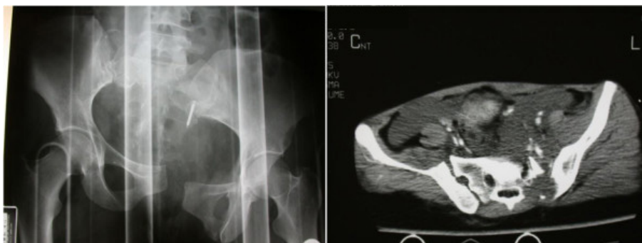
Figure 2 Sacroiliac joint separation.

Radiological investigations included X-rays, angiography, CT and MRI imaging: these examinations were generally performed during the early assessment after the trauma whereas. CT myelography and 3 dimensional MRI (3DMRI) were prescribed after avulsive injuries were suspected (mostly after referral to the Authors).