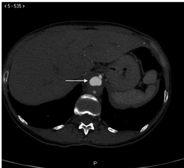
Figure 3. Postoperative CT scan. The white arrow indicates the virtual true lumen at the level of the celiac trunk.

ing thoracic aorta, including acute complicated Type B dissection. The role of TEVAR in the management of this pathology consists in covering the entry tear during the acute phase, inducing false lumen thrombosis, and possibly preventing late aneurysm formation. Indeed, as reported by Conrad et al. [3], TEVAR for acute complicated aortic dissection appears to promote early aortic remodeling, and nearly 90% of patients maintained at least partial false lumen thrombosis at 1 year.