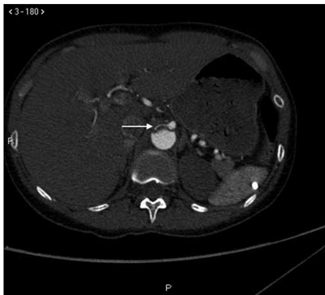
Figure 1. Pre-operative CT scan. The white arrow indicates the virtual true lumen at the level of the celiac trunk.

abdominal aorta; the superior mesenteric artery was arising from the true lumen, the right renal artery was arising at the turn of the two lumens and the inferior left renal artery from the false lumen (Fig. 1); indeed, the true lumens of the superior left renal and inferior mesenteric artery were compressed by the false lumen.