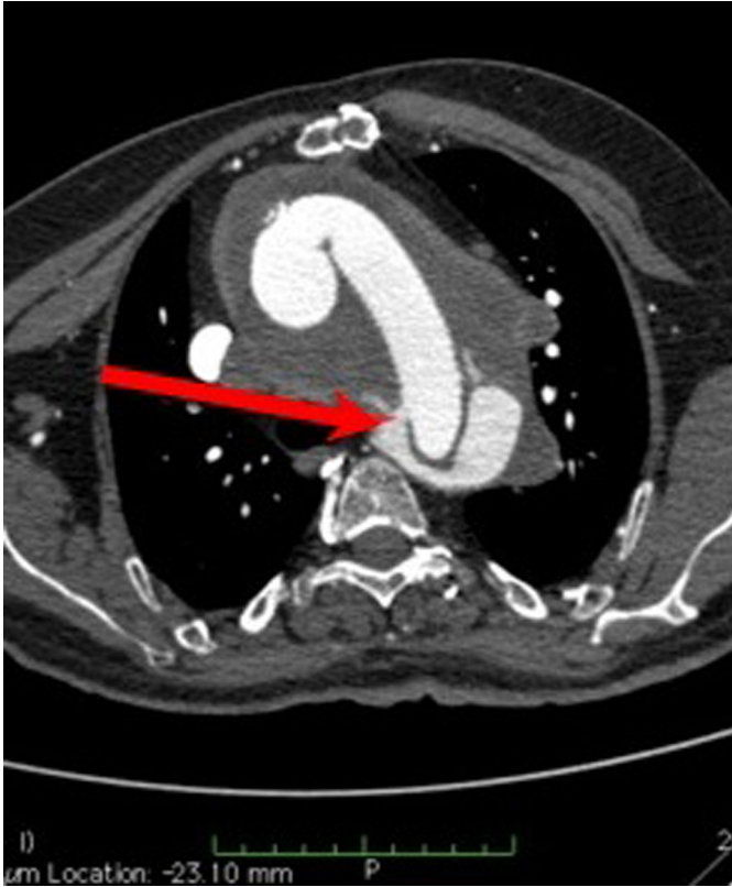
Figure 1. CT shows the periprosthetic fistula, as indicated by the red arrow.

cerebral lesions and evoked potentials showed a left decortication pattern.