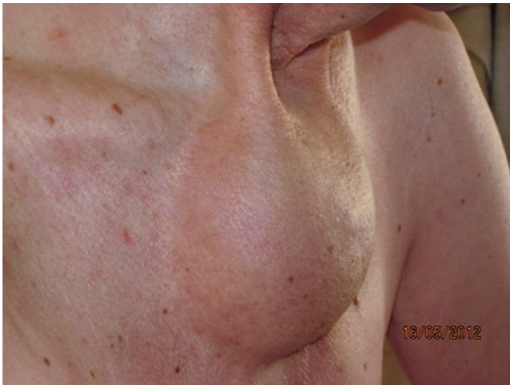
Figure 4. Reduction of presternal swelling after three months.

Acute aortic dissection of the descending aorta is still a life-threatening condition with high mortality and morbidity. Currently, there is consensus that acute uncomplicated type B dissections are managed medically. Conventional resection and graft replacement of the descending thoracic aorta has been the preferred method of treatment only in cases with complications such as aortic rupture, malperfusion of end organs, and/or persistent pain despite medical treatment. Open repair carries a 2.9% to 7% risk of paraplegia and an operative mortality rate ranging from