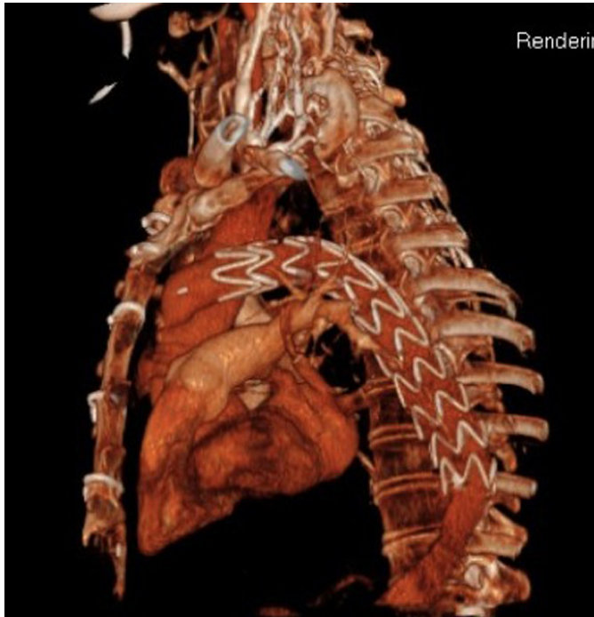
Figure 3. Endoprosthesis in situ.

was evidence of minimum type 1 endoleak, sealed by postdilatation of the endoprosthesis with a 27 mm balloon. Aortography demonstrated a satisfactory result. The patient's condition improved and he was discharged 5 days after surgery.