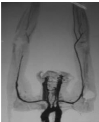
Figure 1. Spiral computed tomography angiogram of both the upper limbs. Note defect in right brachial artery.

Spiral CT angiogram (Fig. 1) showed the presence of an echogenic periarterial lesion in the proximal brachial artery suggestive of pseudoaneurysm or an extrinsic compression by hematoma. The distal brachial artery was found to have filled with thrombus with non-opacification of the radial and the distal ulnar artery. The proximal ulnar artery showed patchy contrast uptake.