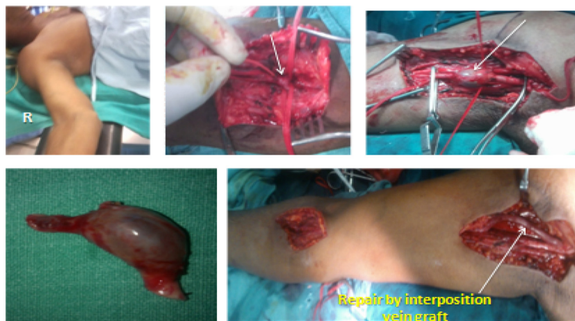
Figure 2. Perioperative photographs.

The right limb was found to be warm with good capillary filling. The patient had relief of pain and numbness. The radial and ulnar arteries had palpable distal pulses. The biopsy sample revealed true aneu-