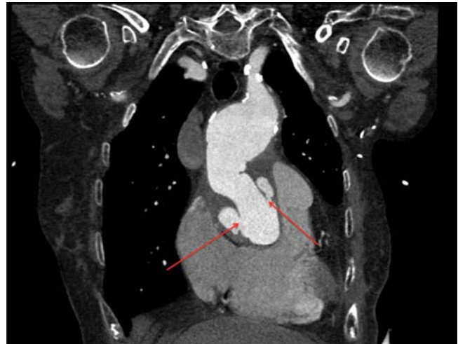
Figure 4. Computed tomography angiography of the chest showing the anterior and posterior extensions (arrows) of false aneurysm of the ascending aorta after its prosthetic replacement.

Major challenges of surgical therapy for these complex cases are choosing an approach that allows for safe reentry into the chest and efficient cerebral protection. The critical risk is FA rupture, which may lead to catastrophic hemorrhage during sternotomy. This risk is greater if the FA is situated retrosternally with an aorto-cutaneous fistula. Selective cerebral perfusion through the carotid arteries is the method of choice in our institution, and its efficacy for cerebral protection has been demonstrated [6–8]. This technique allows for mediastinal dissection and control of the distal aorta