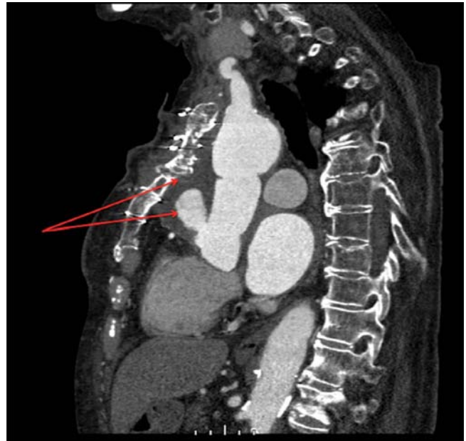
Figure 2. Computed tomography angiography of the chest showing the aorto-cutaneous fistula. Note the false aneurysm containing contrast and surrounding hematoma between the prosthetic ascending aorta, back of the sternum, and skin (arrows).

cleidomastoid cervical incisions by cardiopulmonary bypass (CPB) and cerebral protection for instituting hypothermic partial circulatory arrest before reentry into the chest. Cerebral protection was monitored with near-infrared spectroscopy. CPB and cooling were instituted before skin incision and stopped when the FA rupture occurred during the sternotomy. Cerebral protection was achieved by cooling the patient to 24°C, occluding the proximal left carotid and brachiocephalic arteries, and reducing bypass flow transiently to 800 mL/min. Mediastinal dissection and distal anastomosis between the hemi-arch and Dacron graft (Gelweave Vasculatex Terumo, 32 mm) for hemi-arch replacement were performed under partial hypothermic circulatory arrest. The total duration of partial hypothermic circulatory arrest was 41 min. The distal Dacron graft was then cross-clamped, and normothermic full flow cardiopul-