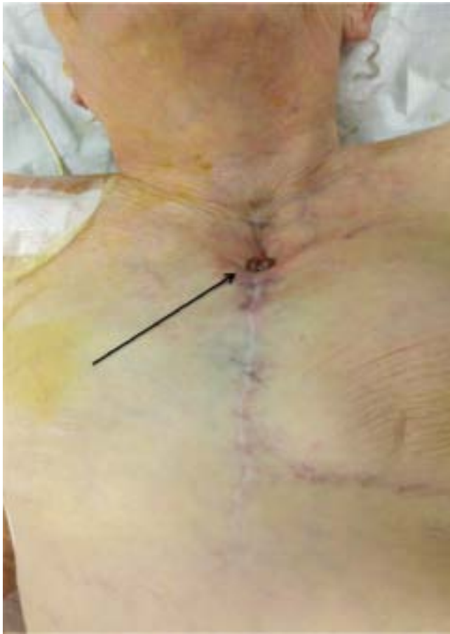
Figure 1. The aorto-cutaneous fistula in the upper part of the sternum.

cleidomastoid cervical incisions by cardiopulmonary bypass (CPB) and cerebral protection for instituting hypothermic partial circulatory arrest before reentry into the chest. Cerebral protection was monitored with near-infrared spectroscopy. CPB and cooling were instituted before skin incision and stopped when the FA rupture occurred during the sternotomy. Cerebral protection was achieved by cooling the patient to 24°C, occluding the proximal left carotid and brachiocephalic arteries, and reducing bypass flow transiently to 800 mL/min. Mediastinal dissection and distal anastomosis between the hemi-arch and Dacron graft (Gelweave Vasculatex Terumo, 32 mm) for hemi-arch replacement were performed under partial hypothermic circulatory arrest. The total duration of partial hypothermic circulatory arrest was 41 min. The distal Dacron graft was then cross-clamped, and normothermic full flow cardiopul-