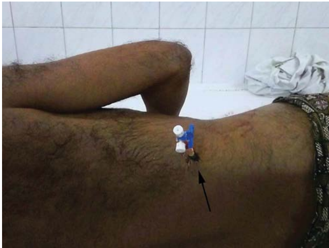
Figure 1. The entire length of the pigtail catheter passed through the right flank (arrow).