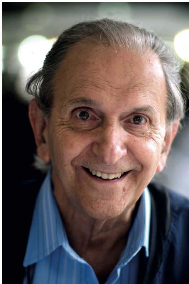
Figure 1. Professor Sergio Mascarenhas.

The treatment chosen for Mascarenhas's condition was a neurosurgical correction of the hydrocephalus with the placement of a ventriculoperitoneal shunt and drainage of excess cerebrospinal fluid (CSF). Having used his experience to investigate the existing technologies for monitoring intracranial pressure (ICP), Mascarenhas was surprised to find that the only methods that had been validated were invasive ones. Unwilling to accept this, Mascarenhas started a study that led not only to the development of a device that would influence medical practice but also to the changes in what had previously been well-established concepts.