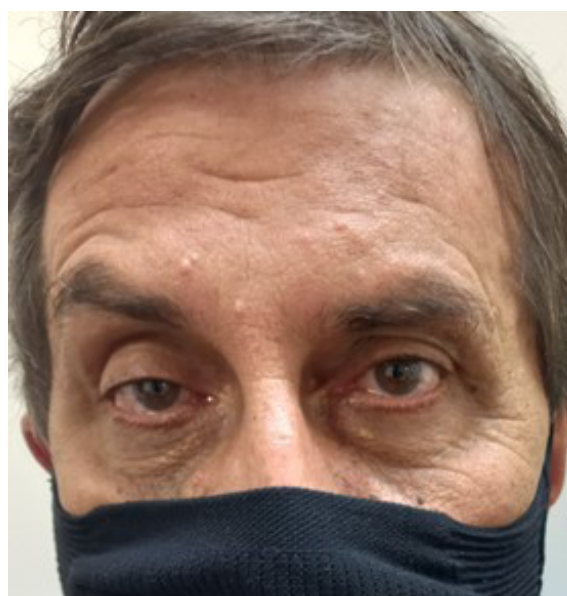
Figure 2. Asymmetrical palpebral ptosis partially compensated by the asymmetric contraction of the frontalis muscle, with uneven elevation of the eyebrows.

Deltoideus, Orbicularis oculi, and Nasalis. The aim of repetitive nerve stimulation is to observe CMAP (compound muscle action potential) amplitude variation during serial stimuli. Low-frequency (<5-Hz) RNS are indicated to evaluate postsynaptic disorders such as myasthenia gravis. With a low-frequency stimulation, acetylcholine release gradually decreases as presynaptic stores of acetylcholine vesicles are depleted, with a nadir at the fourth or fifth stimulation in a series of stimuli. Positive results are considered when a decrement of 10% or higher is noted in the fourth recorded CMAP. The sensitivity of this study for MG ranges from 53% to 100% for generalized MG, and from 10% to 17% for ocular MG 20 . Proximal muscles seem to present anormal decrement with higher frequency for