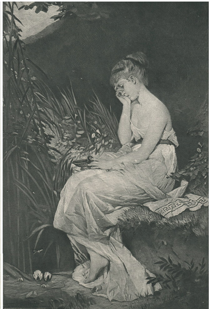
Figure. Left, a Polka-Mazurka brillante on a theme from Thomas' opera Psyché , transcribed for the pianoforte by the Dutch-Jewish composer Joseph Ascher (1829–1869). Right, a vintage engraving of the mythological Psyche , portrayed by the German painter Alfons Bodenmüller (1847–1886).