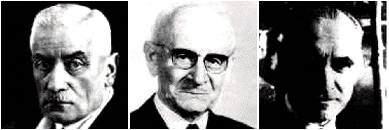
Figure 1. Georges Charles Guillain (1876-1971), Jean Alexandre Barré (1880-1967) and André Strohl (1887-1977).