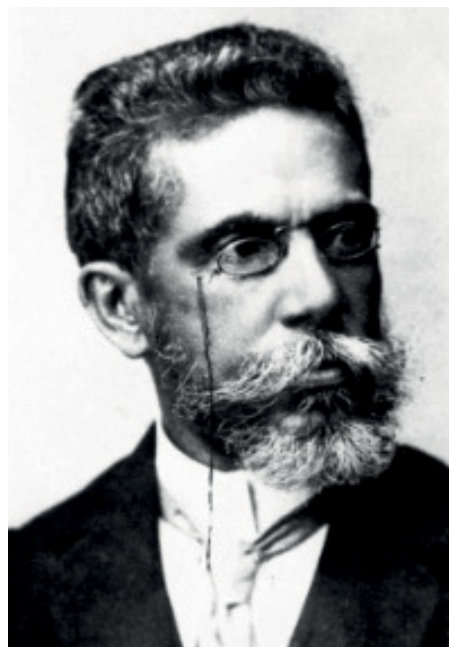
Figure 3. Machado de Assis (1839-1908): the most significant Brazilian writer