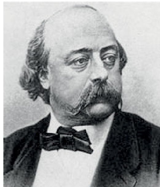
Figure 1. Gustave Flaubert (1821-1880), the author of Madame Bovary .

His friend Maxime du Camp reported many of Flaubert’s crises: “Very often, distraught and powerless to intervene, I would witness his seizures, which were indeed terrifying to