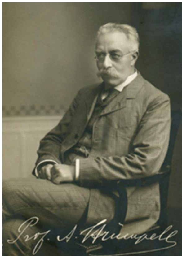
(Extracted from http://www.200.uk-erlangen.de/de/geschichte/20-koepfer-erlangeruniversitaetsmedizin/struempell/ , April 08th, 2017).

In 1880, the Baltic-German (region known today as Estonia and Latvia) neurologist Ernst Adolf Gustav Gottfried von Strümpell (Figure 1) published the first case series of patients with HSP. Strümpell reported on two siblings with a probable AD-HSP whose symptoms manifested at 37 and 56 years of age. Clinically, these patients showed a pure form of spastic paraplegia. After the death of one of the siblings, neuropathology showed degeneration of the lateral corticospinal tract, fasciculus gracilis and spinocerebellar tract 17, 18 . Wilhelm Erb was probably the first to describe a condition dominated by limb spasticity. Although controversy persists, most authors today consider Erb's works to be the first description of primary lateral sclerosis. A case description by Otto Adolph Seeligmüller, in 1876, has long been disputed as the first description of HSP. Nevertheless, a critical analysis of Seeligmüller's publication highlighted that the patient studied had a clinical picture dominated by muscular atrophy and bulbar paralysis, features not suggestive of HSP itself. In 1888, Maurice Lorrain, a French neurologist, published a more detailed contribution to the anatomical and clinical study of HSPs; hence HSP also being known as Strümpell-Lorrain disease 19, 20 .