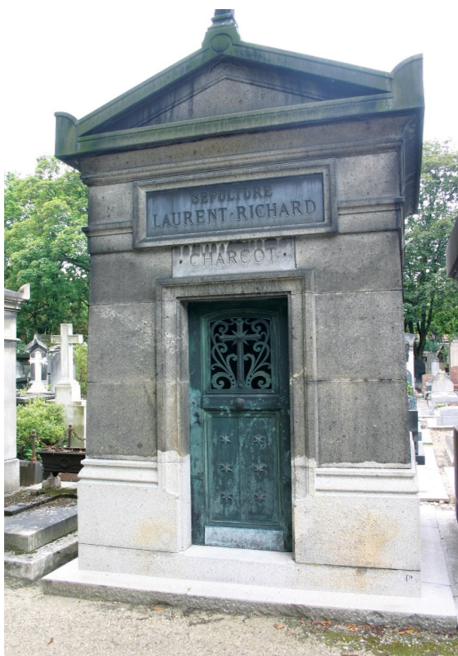
Figure 4. Charcot’s grave at Montmartre cemetery.

Professor Jean-Martin Charcot, a leading figure of international neurology in the 19 th century, whose teachings and discoveries are still of great importance, died on August 16, 1893, in the province of Morvan in the French countryside. His funeral took place in Paris at the Salpêtrière Hospital, and he was buried in Montmartre cemetery in Paris.