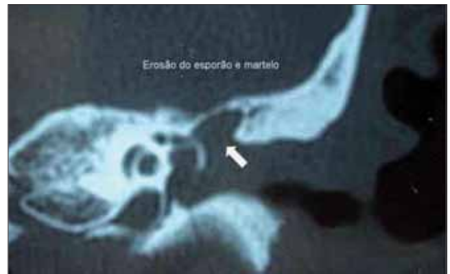
Figure 1. Erosion of the spur and hammer.

The computed tomography (CT) of temporal bones demonstrates with large accuracy the presence of abnormal tissue in the middle ear, but cannot define whether this tissue with soft parts density represents or not the presence of a cholesteatoma. Nevertheless, when connected to osseous erosion of some structures like ossicular chain (Figure 1), tympanic tegmen (Figure 2), bony labyrinth (Figure 3) and lateral attic wall (Figure 1), etc., it is strongly indicative of cholesteatoma (5). The literature shows a sensitivity ranging from 70 (4) to 96% (6,7) for identification of the cholesteatoma in these cases. The CT is also crucial for the demonstration of the middle ear anatomy and possible complications such as fistulas of the lateral semicircular canal and tegmen or canal dehiscence of the facial nerve. The use of CT in the preoperative evaluation of the patient with chronic otitis media is still controversial nowadays. Some otologists use it regularly aiming to evaluate the extension of the disease, schedule the surgical technique to be adopted and identify potential scenarios of risk of complications (8, 9). Others reserve its utilization for cases of suspicion of complication, recurrence or diagnostic doubt, using the surgical indication only for the clinical profile presented (5, 10). The objective of this study is to connect clinical and radiological findings of patients with chronic