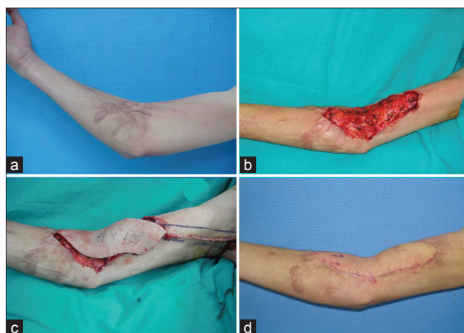
Figure 2: (a) Severe antebraclial contracture. (b) Intraoperative view of contracture releasing. (c) 19 × 8 cm the thoracodorsal artery perforator flap was elevated and transferred the defect area. (d) Postoperative appearance 8 months after surgery

A 20-year-old man had suffered postburn right antecubital