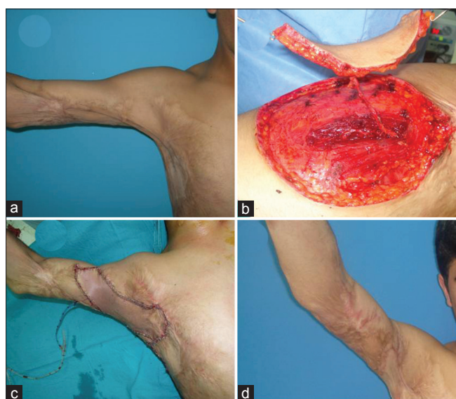
Figure 4: (a) Severe axillary burn contracture. (b) The thoracodorsal artery perforator flap on a single perforator. (c) Intraoperative view. (d) Postoperative appearance 14 months after surgery

The perforator flap depending on muscle perforators without including the underlying muscle was first