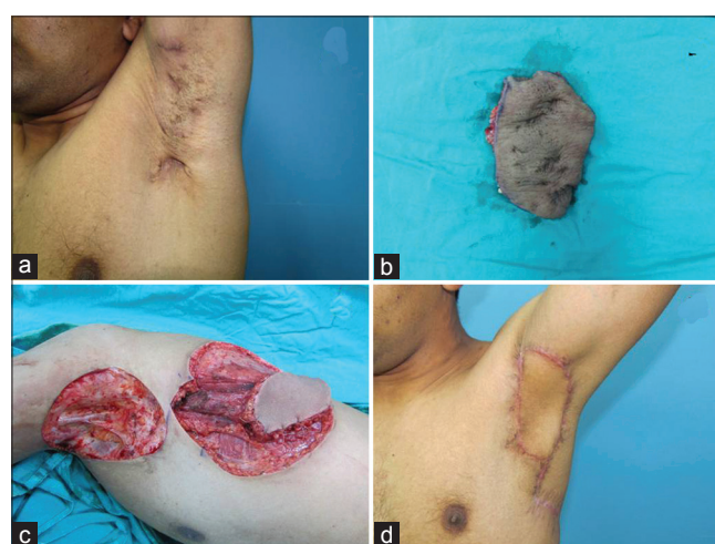
Figure 3: (a) Preoperative view of chronic left axillary hidradenitis. (b) Excision of hydraadenitis. (c) Design of a the thoracodorsal artery perforator flap according to the defect size. (d) View 10 months after surgery

A 20-year-old man patient sustained a flame burn to