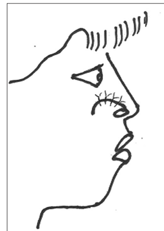
Figure 3: Closure