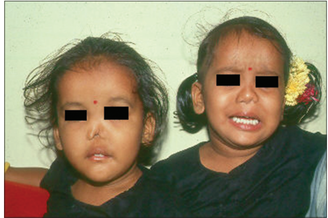
Figure 1: Twin sisters with cleft ala. The one on the left has absence of columella as well

A posteriorly based rotation flap of full thickness of ala was marked so as to mimic the alar crease. The ala was incised through and through with a no.11 blade [Figures 2 and 3].