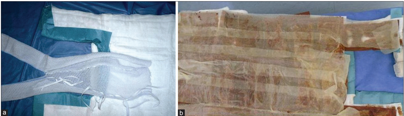
Figure 1: Custom-made over-dressings for torso burns. (a) A U-shape cut is made at one end of the Gamgee to design the shoulder straps and an Op-tape is used to cover the cut ends of the Gamgee dressing. A custom-designed netted vest using Surgifix ® . (b) The inner layers of the dressing can be prepared over the custom-made Gamgee before application to the patient

Application of the dressing for an anaesthetised patient starts with passing one of the sleeves of the netted vest through the arm and then the patient is rolled onto the side. The Gamgee pad with the shoulder straps is placed over the back such that the straps are coming out anteriorly. The vest is then pulled over the Gamgee to