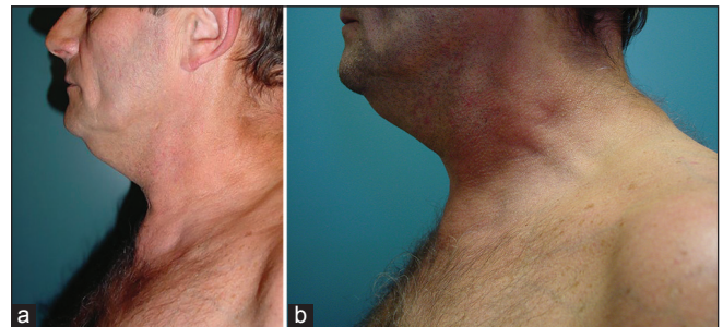
Figure 2: Case 1, submandibular and jugular masses: (a) Pre-treatment view; (b) post-treatment view