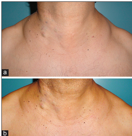
Figure 3: Case 2, bilateral supraclavicular masses: (a) Pre-treatment view; (b) post-treatment view