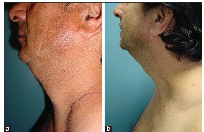
Figure 4: Case 2, submental mass: (a) Pre-treatment view; (b) post-treatment view