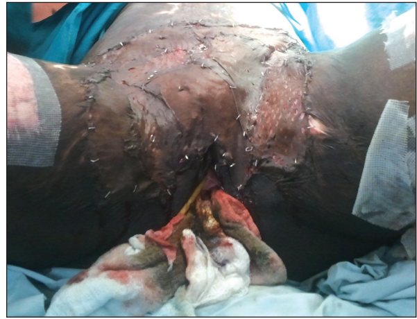
Figure 4: Postoperative photograph of the perineal view