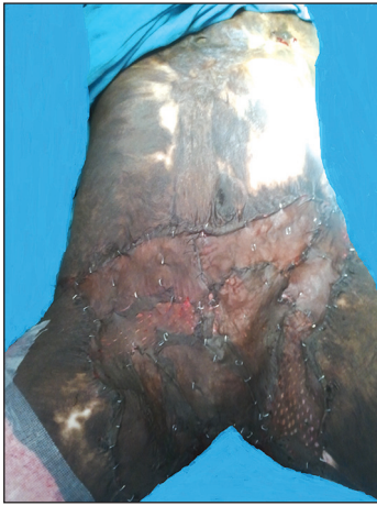
Figure 3: The postoperative view of the case with grafts in situ