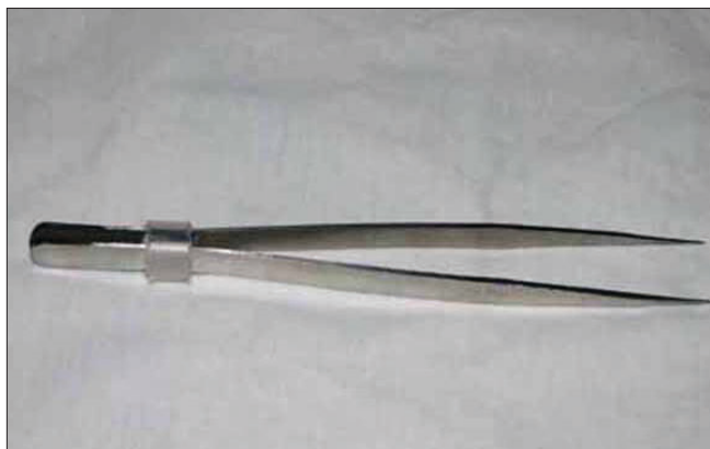
Figure 1: Disarticulated forceps blades mounted with insulation material in between