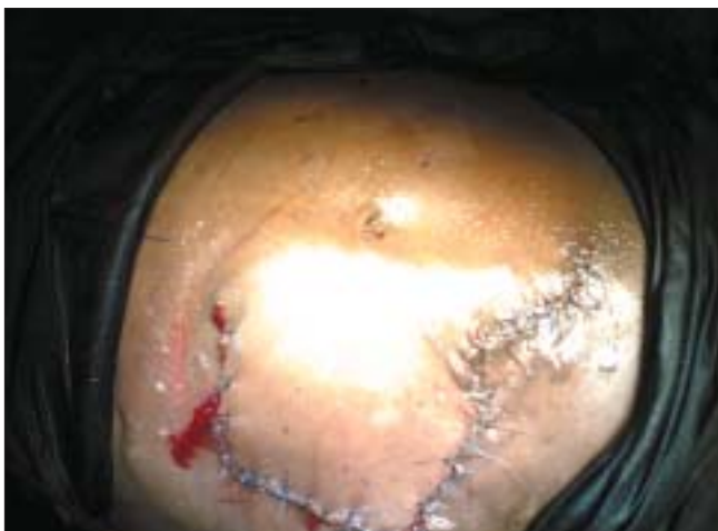
Figure 3: Immediate post operative photo of case 1