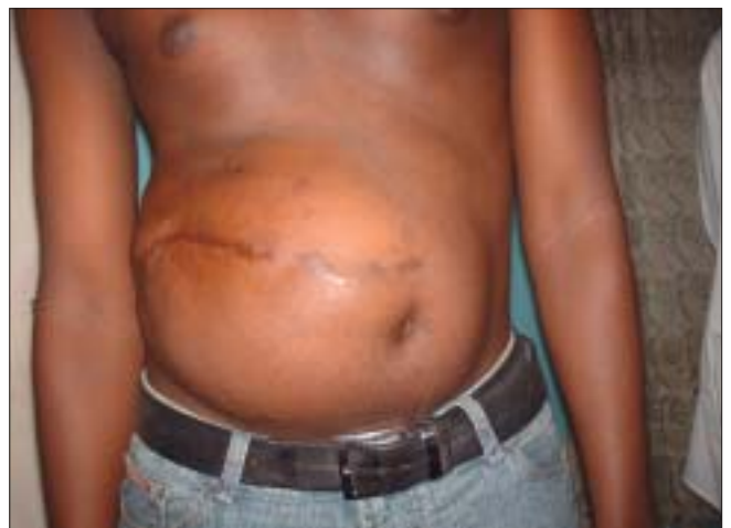
Figure 6: Preoperative photo of case 2

well-hydrated and no significant peripheral lymph node enlargement. The abdominal examination revealed an ulcerated nodular mass in the epigastric region on the