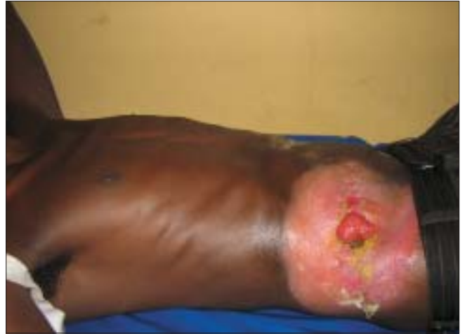
Figure 4: Late post operative photo of case 1