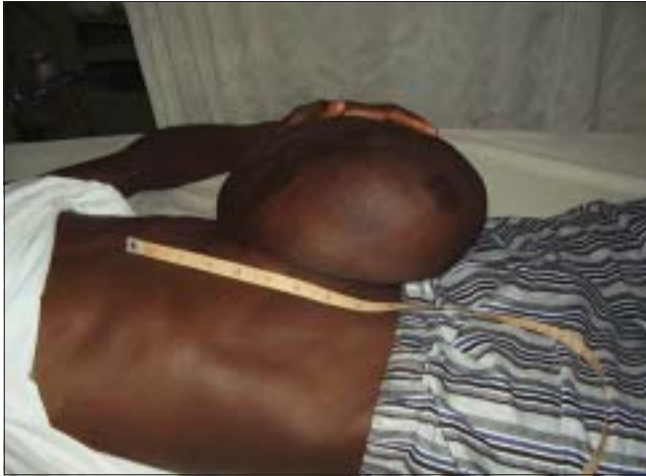
Figure 1: Preoperative photo of Case 1