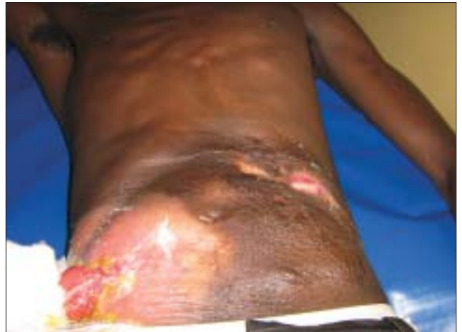
Figure 5: Late post operative picture of case 1