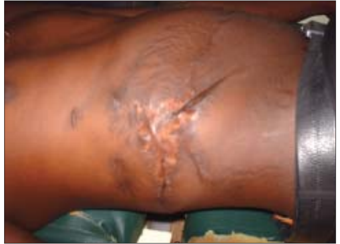
Figure 10: Late postoperative photo of Case 2