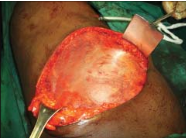
Figure 8: Mesh insitu case 2