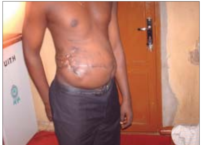
Figure 11: Late postoperative photo of Case 2 erect