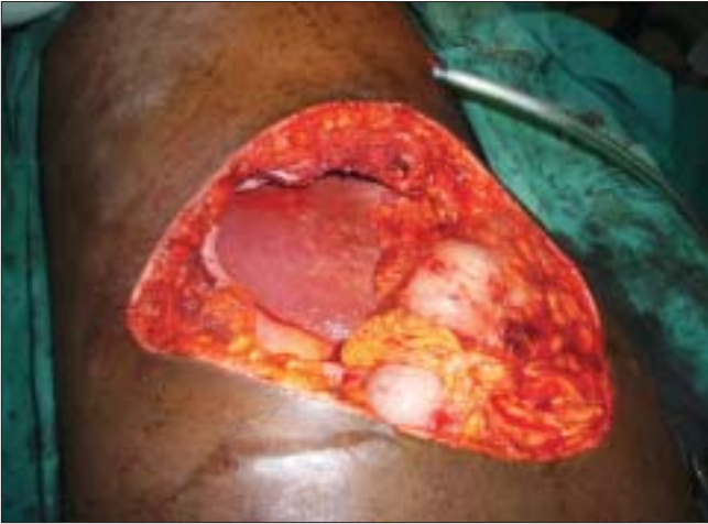
Figure 7: Intraoperative photo of case 2