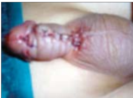
Figure 12: Immediate postoperative picture after with slight ventral binding [AUA]

1.5 cm as reported by El Saadi et al. [10] As a realistic goal, to create a nearly normal urethra, we believe that AUA operation is the most optimum technique, as the urethra itself is mobilized within its corpus spongiosum until the neomeatus and no one is able to create a urethra like the naturally formed urethra. Also, the TIP operation may need an expert surgeon for tubularisation of the neourethra and its calibration, it may also decrease the chance for repeat operation due to previously incised urethral plate versus AUA that does not affect the urethral plate. There is however contrary data published by Elicevik et al. [11]