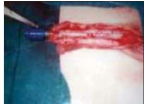
Figure 7: Intraoperative picture after urethral tubularisation