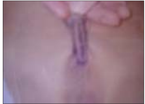
Figure 6: Preoperative marking of the midline and U shaped incisions [TIP]