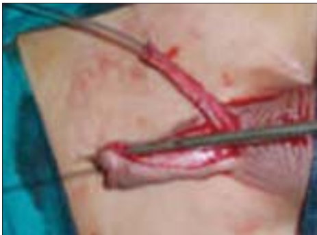
Figure 4: Making vertical meatus with the blade of the scalpel [AUA]