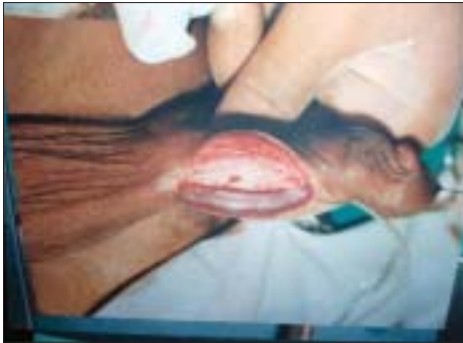
Figure 2: Complete urethral dissection including its corpora [AUA]