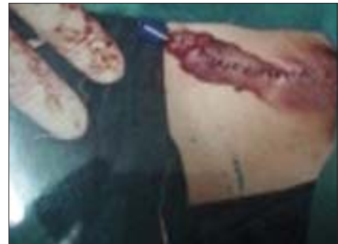
Figure 8: Tubular-shaped glans after TIP