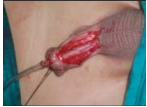
Figure 5: Tunneling the urethra within the glans [AUA]