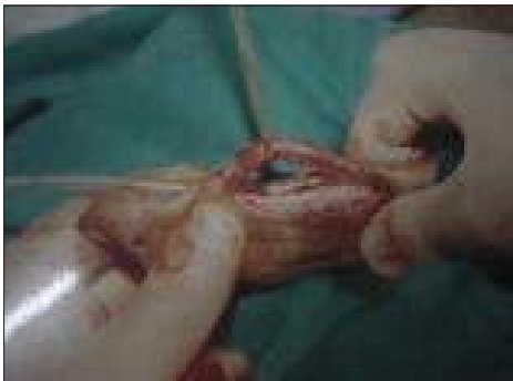
Figure 3: Middle urethral elevation [AUA]