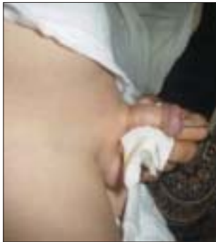
Figure 9: Postoperative picture after one and half years with direct urinary stream [AUA]