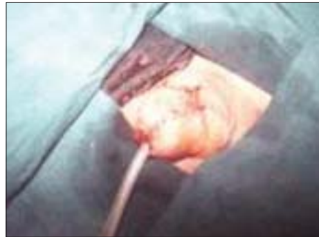
Figure 13: Good cosmetic appearance, conical shaped glans, after [TIP]