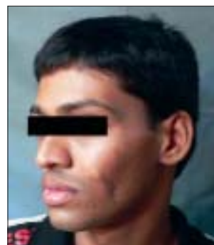
Figure 7: Post-op showing healed surgical wound without any recurrence