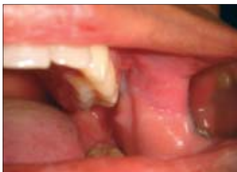
Figure 2: Intraoral photograph showing scarred papilla of parotid duct