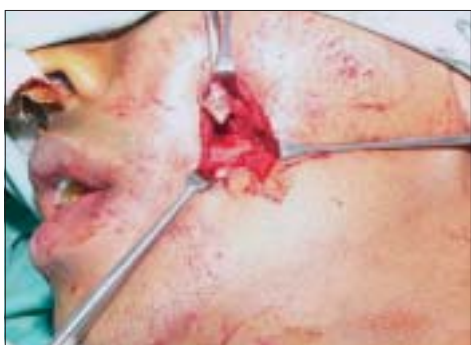
Figure 4: Intraoperative photograph showing the sinus tract with skin cuff, parotid duct and the maxillary tooth roots

masseter and turns medially at its anterior border to pierce the buccinator. It travels for a varying distance beneath the buccal mucosa and opens in the papilla opposite the second maxillary molar. [1] The course of the duct can be marked on the surface as the middle third of a straight line drawn from the anterior aspect of the tragus to the midpoint of the upper lip. [2] The duct is accompanied by the buccal branch of the facial nerve and the transverse facial artery during its course and these structures are at risk of injury during surgery for the duct fistula. Wounds across this line should be assessed meticulously for injury to these structures. [2]