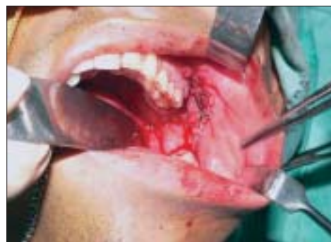
Figure 6: Internalization of the fistula with suturing of skin cuff to mucosal opening and extracted left maxillary second and third molars