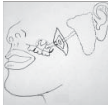
Figure 5: Line diagram showing the dental sinus tract, parotid duct and the fistulous opening with skin cuff