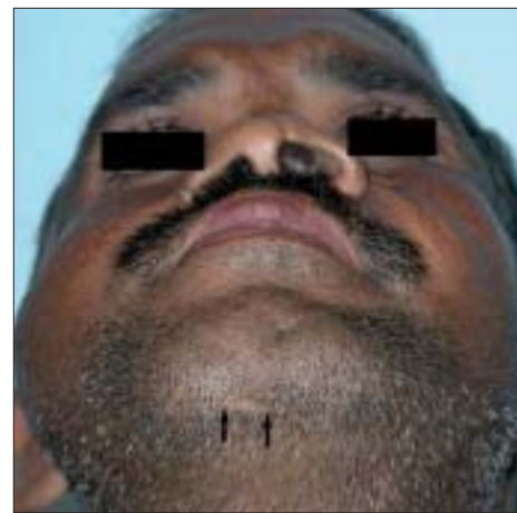
Figure 4: Healed scar of at 6 months (between arrows).The scar is hardly perceptible