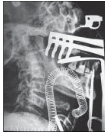
Figure 3: Intraoperative radiograph showing course of the submental intubation