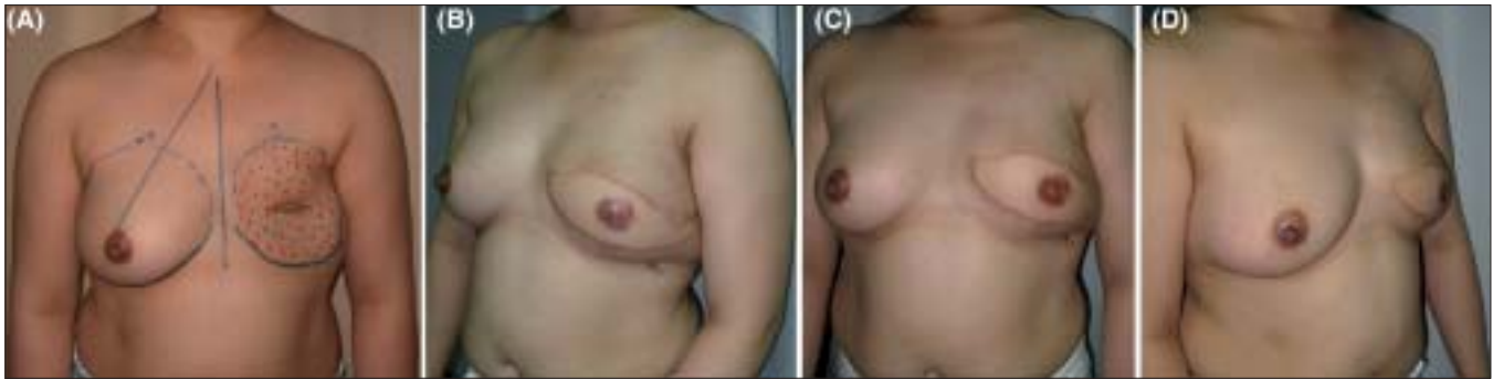
Figure 4: (A) Preoperative view of a patient presenting for delayed breast reconstruction with markings on the chest. (B-D) 12 months postoperative left oblique, front and right oblique views respectively