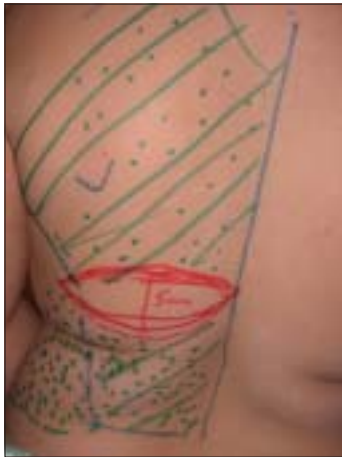
Figure 2: Preoperative markings while the patient is standing. Note the transversely oriented skin paddle and the dotted areas representing the adipofascial extensions of the scapular and the lumbar region

marked out. The skin island was situated in the middle part of the muscle.