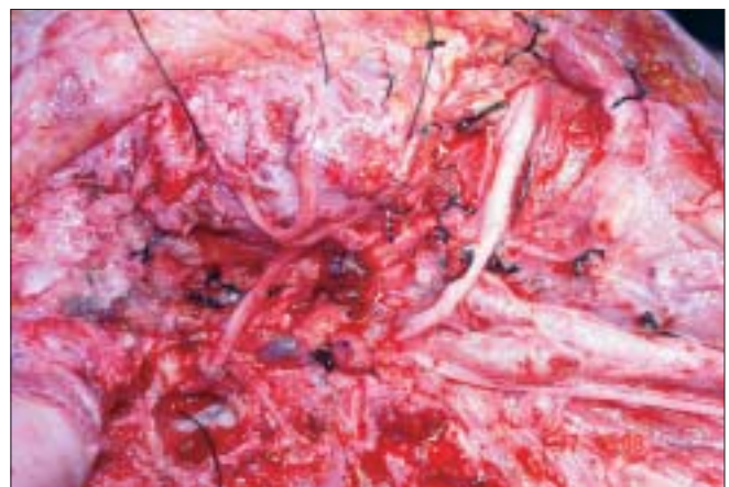
Figure 1C: The complete nerve anastomoses are shown; the surgical field shows the distal part of the graft anastomosed to the stump of the main trunk of the facial nerve and its proximal divisions sutured to the zygomatic, buccal and mandibular branches