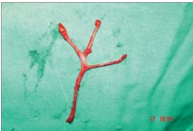
Figure 1B: The graft of the great auricular nerve with cervical roots