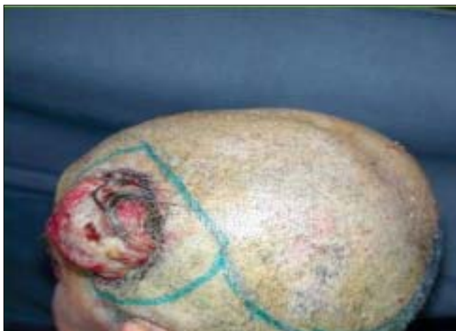
Figure 9: Resection of the tumor and a designed scalp flap