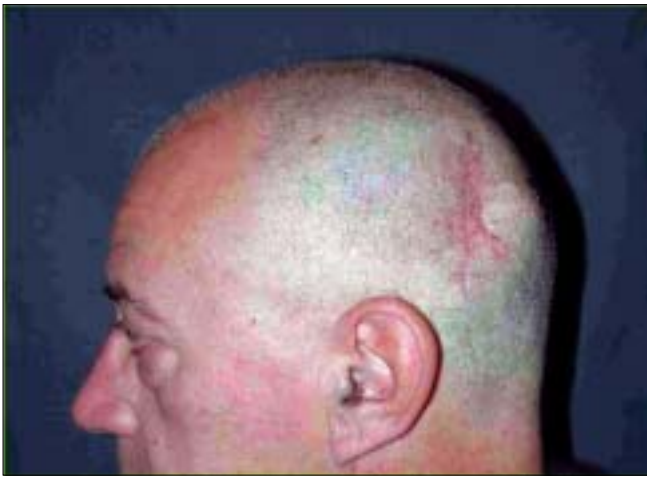
Figure 1: Cylindroma of the scalp