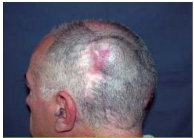
Figure 4: Aggressive local recurrence