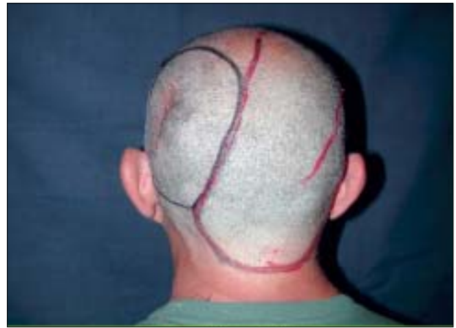
Figure 2: Area of resection and drawing flaps of the scalp