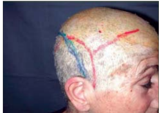
Figure 10: Irrigation of the scalp flap