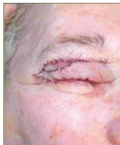
Figure 6: Eyelid reconstruction by means of an orbicularis oculi musculocutaneous flap

results indicated a carcinoma of the sebaceous cells [Figure 5]. Complete tumor resection was carried out and eyelid reconstruction was performed with graft of