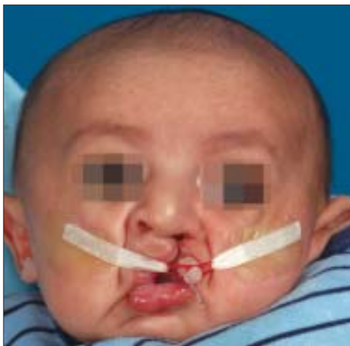
Figure 2: Unilateral cleft baby with a NAM plate showing the retention arm positioned approximately 40° down from the horizontal to achieve proper activation and to prevent unseating of the appliance from the palate. Note that there is no nasal stent placed for the first few weeks of treatment

the moulding plate. No more than 1 mm of modification of the moulding plate should be made at one visit. The alveolar segments should be directed to its final and optimal position. Care must be taken to prevent the soft denture material from building up on the height of the alveolar crest as this will prevent complete seating of the moulding plate.