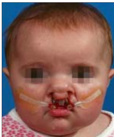
Figure 3: (C) The bilateral NAM plate in position showing the tape adhered to the prolabium and stretched to the plate and attached to the plate