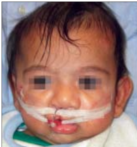
Figure 3: (B) Unilateral NAM plate with a nasal stent showing lip taping.

In bilateral cases, there is a need for two retention arms as well as two nasal stents which are similar in shape to the unilateral stent. After adding the nasal stents in the bilateral cleft, the attention is focused on non-surgical lengthening of the columella. To achieve this objective, a horizontal band of the denture material is added to join the left and right lower lobes of the nasal stent,