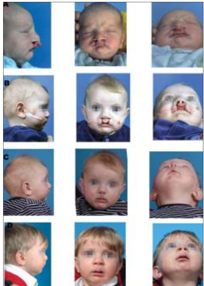
Figure 4: A bilateral complete cleft lip and palate infant treated with NAM therapy. (A) Prenasoalveolar moulding therapy, (B) post-nasoalveolar moulding therapy. Note the non-surgical columella elongation, (C) post-surgical photograph, (D) 1-year follow-up