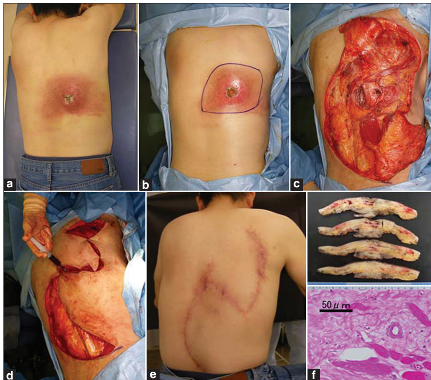
Figure 2: (a) A 59-year-old man. An ulcer with severe spontaneous pain was observed on his right dorsum, 8 months after the last fluoroscopic angioplasty procedure. (b) Excisional design. (c) Surgical debridement was done, and the skin flaps were raised. (d) Injection of bm-PRP into the wound bed and edges. (e) Seven months after the surgery, the Pain-free condition was obtained. (f) Cross-sections of the debrided tissue. Marked fibrosis throughout the sections can be observed. (g) A high magnification micrograph of the deep portion of the specimen. Significant fibrotic tissue replaced the muscular structure. A decrease in the viable cells is obvious (haematoxylin-eosin staining)