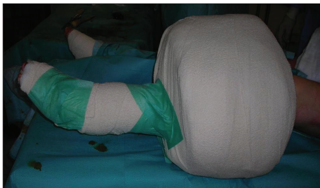
Figure 2: Donut Dressing at the mid calf to protect heel reconstruction