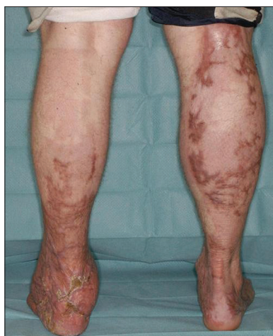
Figure 3: Complete wounds healing, three month follow-up

could rotate with patient movement, this technique was effective in maintaining continuous elevation not only when the patient was supine, but also when the patient was being turned, and if the patients turned on their side during sleep. It also prevented the patients crossing