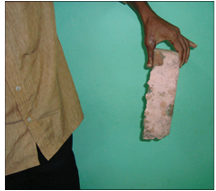
Figure 7: Excellent strength achieved after toe transfer (left thumb)