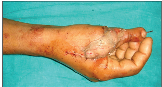
Figure 4: Intraoperative view of second toe transferred to thumb. Also seen the grafted area to avoid wound closure with undue tension

marked. A tourniquet was raised. A 'V' shaped incision was taken at the base of the second toe and extended proximally. Superficial dorsal veins were dissected. The first dorsal metacarpal artery (FDMA) was seen dorsal to the dorsal interosseous muscle, and dissected proximally. The slip of extensor digitorum longus (EDL) and the deep peroneal and dorsal digital nerves, were dissected proximally. The plantar dissection was started by taking 'a V' shaped incision extending proximally up to the instep area. Plantar digital arteries and nerves were identified and proximal intraneural dissection was done. The Flexor Hallucis Longus (FHL) tendon was dissected proximally for adequate length. Disarticulation was done at second metatarsophalangeal (MTP) joint. Vascularity to the toe was confirmed after the release of tourniquet.