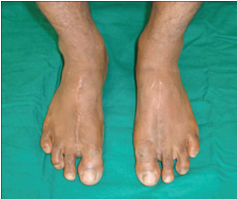
Figure 8: Minimal donor side morbidity which goes unnoticed