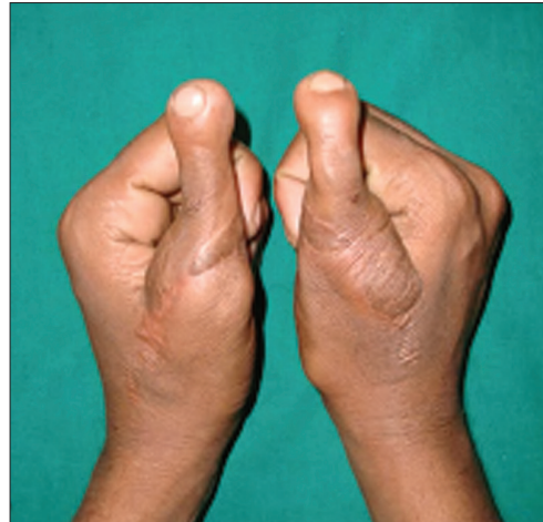
Figure 9: Excellent strength achieved after toe transfer

Residual raw areas on the radial and ulnar aspect of the reconstructed thumb were grafted [Figure 4].