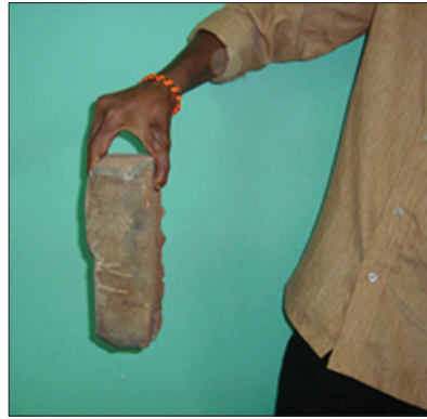
Figure 6: Excellent strength achieved after toe transfer(right thumb)