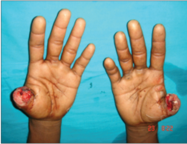
Figure 1: Preoperative view of amputated bilateral thumbs