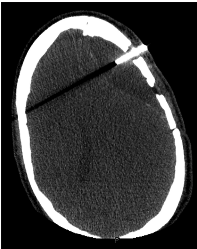
Figure 3: A 13G coaxial bone biopsy system needle was introduced into the collection through a burr hole