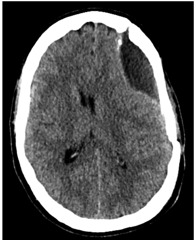
Figure 2: Computed tomography scan of the brain demonstrating recurrence of extradural collection causing subfalcine herniation