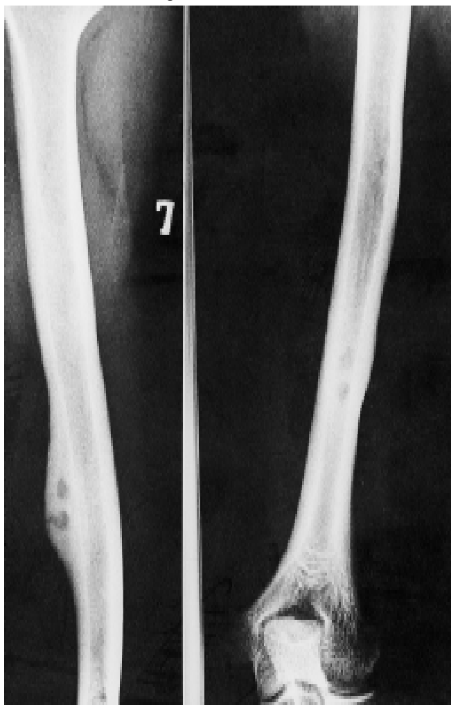
Figure 1. Radiograph humerus showing two lucent lesions.

Osteoid osteoma is a common benign lesion consisting of small (upto 2 cms.) nidus of highly vascularized osteoid tissue surrounded by peripheral zone of sclerosis. Only rarely they multifocal. Very few cases have been reported in the literature of multifocal osteoid osteomas (2,3,4). The authors present a case of multifocal osteoid osteoma with two nidi involving the lower shaft of Humerus.