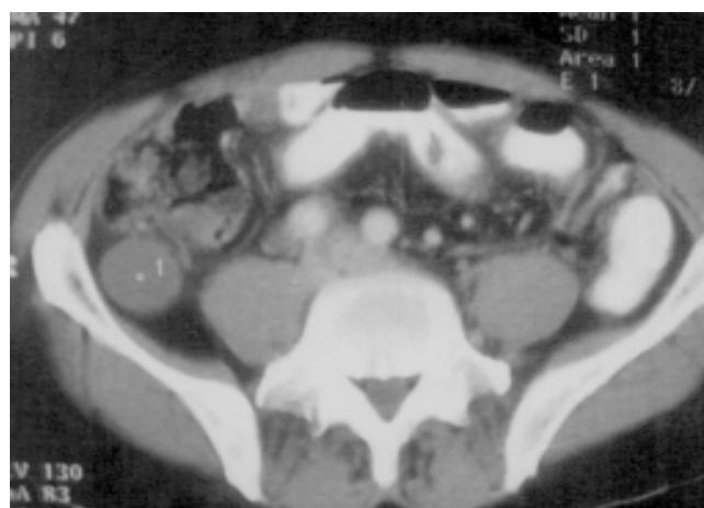
Fig. 2 & 3: CT sections showing low attenuating smooth lobulated mass in relation to the caecum suggestive of mucocoele of appendix.

The term mucocoele of appendix was first described by Rokitansky in 1842 [2]. Higa et al preferred to consider all the mucocoeles as mucinous neoplasms within a clinico-pathological spectrum comprising of mucosal hyperplasia, mucinous cystadenoma and mucinous