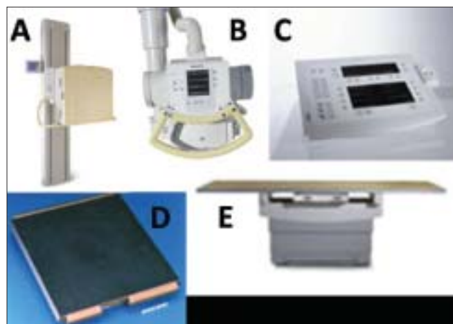
Figure 3: Diagram depicting various parts of a direct digital radiography system (A) vertical stand. (B) tube. (C) console. (D) detector. (E) couch

(b) Pixel size: All digital detectors are made of arrays of pixels (strictly speaking these should be called detector elements or dels). Spatial resolution in digital imaging is a function of pixel size, with a smaller pixel yielding higher resolution. A variety of pixel sizes of detectors are offered