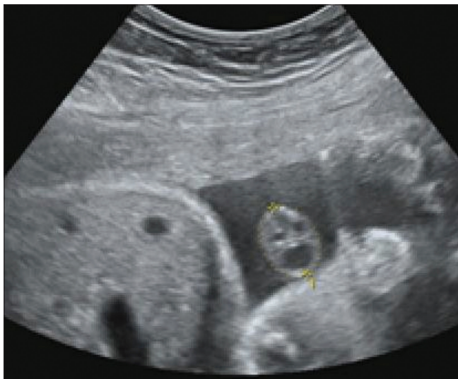
Figure 1: Transverse USG shows the method of measurement of the cross-sectional area of the umbilical cord (dotted circle)

Gestational age was based on a reliable last menstrual period or the earliest USG examination before 20 weeks of gestation. Routine pregnancy USG was performed in all cases and a normal amniotic fluid index was confirmed. Fetal anomaly was ruled out by an anatomic survey. Then, umbilical cord thickness, cross-sectional area, and coiling index were measured in a free-floating loop of umbilical cord using the software in the USG unit [Figure 1]. All USG