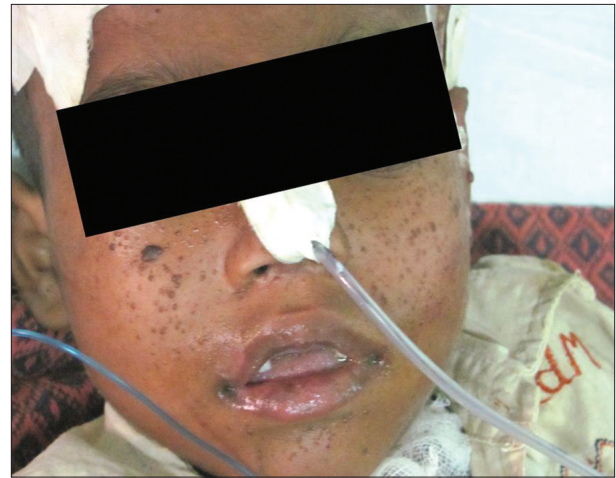
Figure 1: Clinical photograph demonstrating cutaneous adenoma sebaceum

Subependymal giant cell astrocytoma is a rare, slow-growing intraventricular tumor arising classically in 6-16% cases of tuberous sclerosis (TS). [1] TS is an autosomal dominant neurocutaneous phacomatosis with an incidence of 1 in 10,000. It comprises of hamartomatous tumors [2] and malformations affecting multiorgan systems, the central nervous system (CNS) being the most commonly involved. CNS lesions include cortical tubers, subependymal nodules, white matter heterotrophies and subependymal giant cell astrocytomas. [3] Other lesions include renal angiomyolipomas, cardiac rhabdomyomas and cystic lung disease, etc. Clinically, TS is characterized by Vogt's triad of mental retardation, seizures and adenoma sebaceum. SEGA are usually located in the lateral ventricles near the foramen of munro, causing obstructive hydrocephalus. [4,5] Radiological findings include sharply marginated and uniformly enhancing lesion on CT and magnetic resonance imaging, with hydrocephalus and size >1cm 3 . Grossly, it is a sharply delineated, spherical or multinodular mass of fleshy grey-pink tissue, anchored to the ventricular wall over a broad front. Tumor has a good prognosis, and recurrence is rare after surgical resection. Hence, the need for having a high index of suspicion and early identification of SEGA in patients of tuberous sclerosis can help prevent complications.