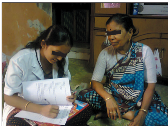
Figure 1: Personal interviews being conducted at the house of participant woman to collect the pre-intervention data

The women in Trombay are predominantly housewives or engaged in part-time occupation of selling fish. Hence, most of the participant women were available for the counseling interventions. Throughout the program, all efforts were made to maximize compliance. In the case of nonavailability of participant women, multiple visits were made to their houses to contact and invite them to participate in the program activities.