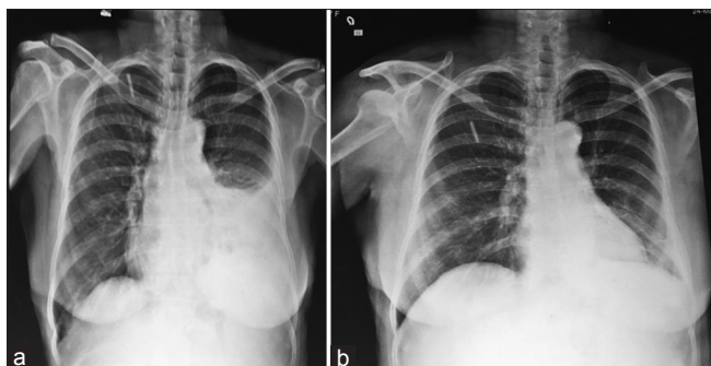
Figure 1: (a) Initial chest X-ray showing left lower zone homogeneous opacity. (b) Repeat chest X-ray showing improvement

antitubercular drugs with jaundice. She noticed yellowish discoloration of the sclera for 1 week, but did not have a history of fever, vomiting, itching, or clay-colored stools. A repeat physical examination demonstrated icterus and mild splenomegaly, which was firm and nontender. The liver function tests showed direct hyperbilirubinemia, moderately elevated transaminases with normal alkaline phosphatase and albumin. The prothrombin time and rest of the blood tests were normal. Hepatitis A, B, C, and E serologies were negative. Antinuclear antibody was negative. A repeat abdominal ultrasonogram showed normal liver and splenomegaly with an increase in size (8.2 cm × 6.4 cm) of the focal lesion in the spleen. Contrast-enhanced CT of the abdomen showed heterogeneous area in the spleen measuring 8.2 cm × 6.4 cm with contrast enhancement and perisplenic and perigastric nodes [Figure 2b].